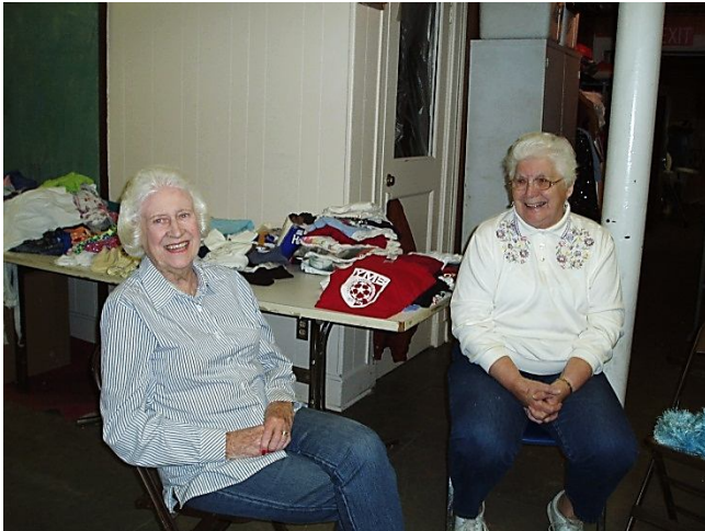
GETTING READY FOR A RUMMAGE SALE!

WHEN? Friday and Saturday, October 19 & 20