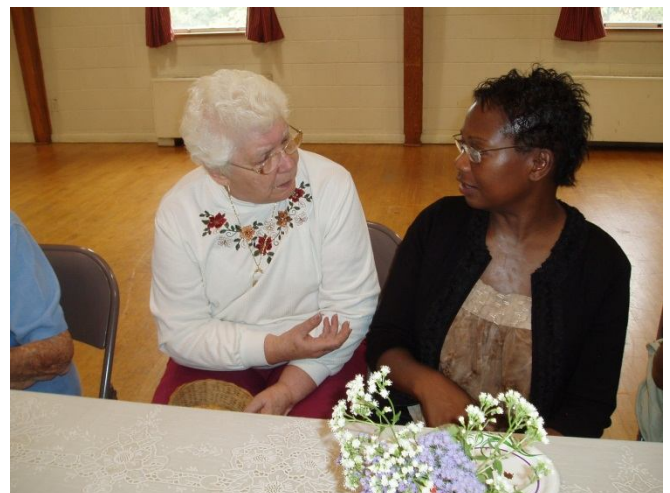
ENJOYING AN INTERESTING CONVERSATION!